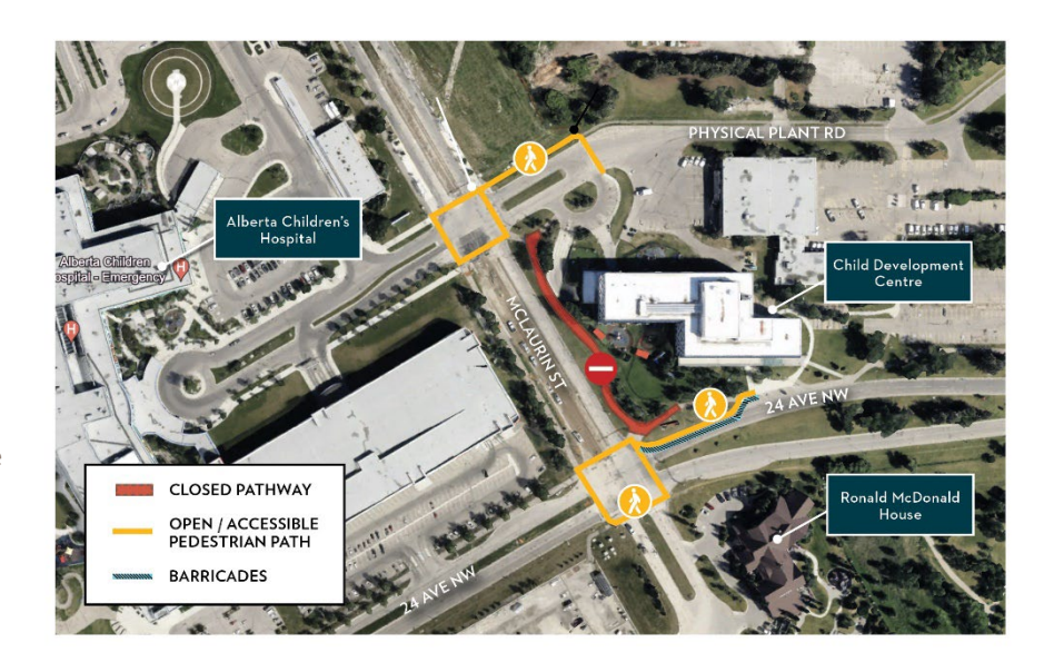
*An enlarged map is provided below.

ALL CONSTRUCTION ACTIVITIES AND TIMELINES ARE DEPENDENT ON VARIOUS FACTORS AND ARE SUBJECT TO CHANGE.